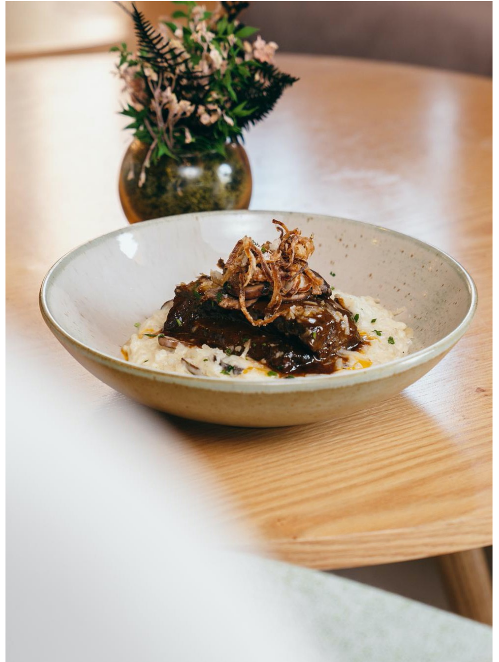
Short Ribs Risotto