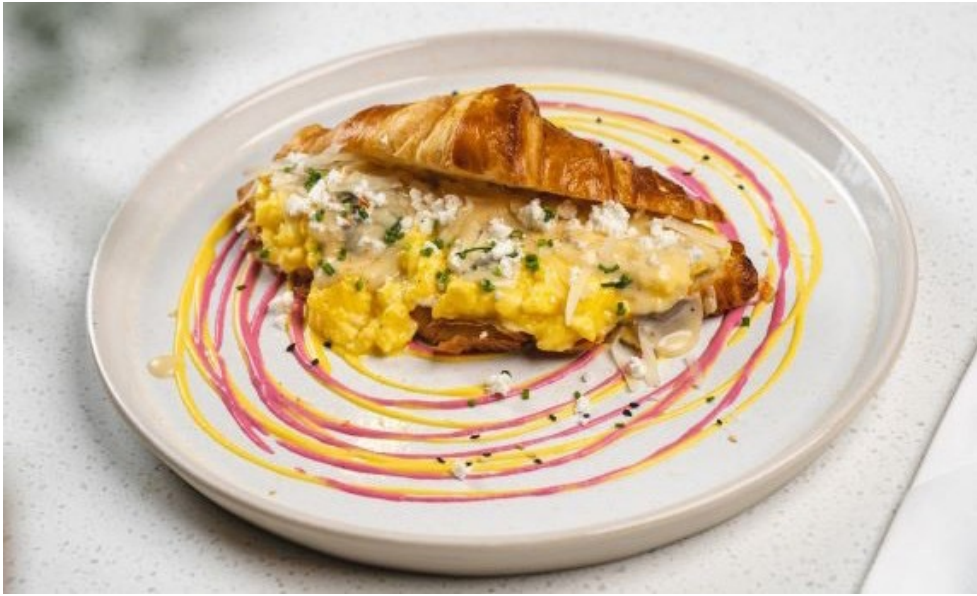
It's So Fluffy!