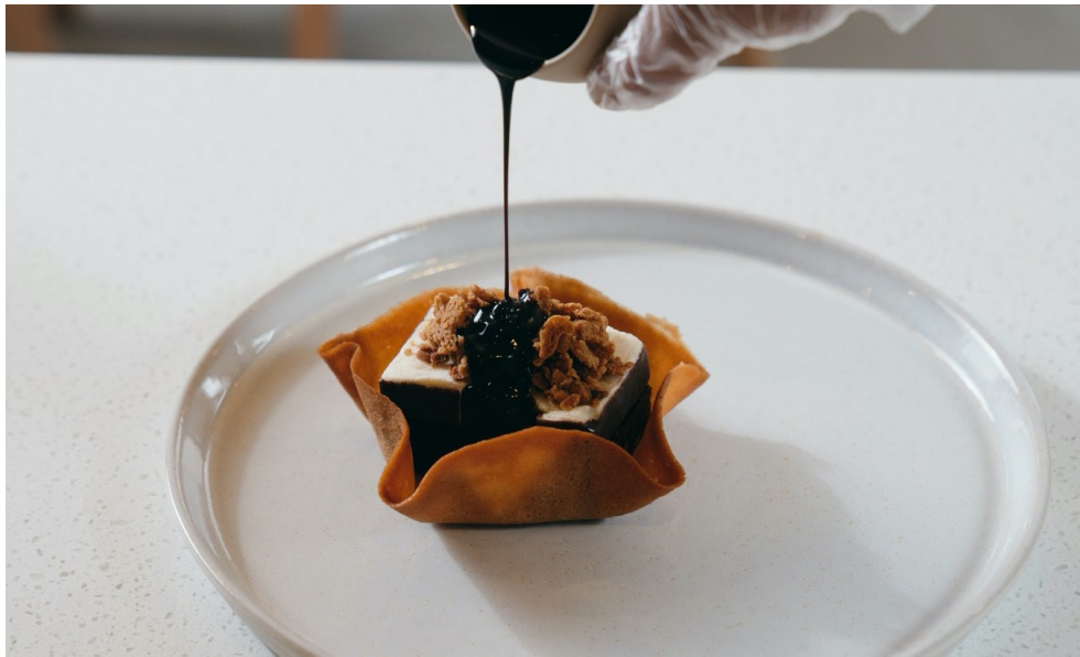
Brownie "But Not"