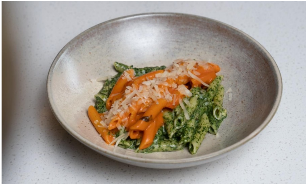
Two Tones Chicken Pasta