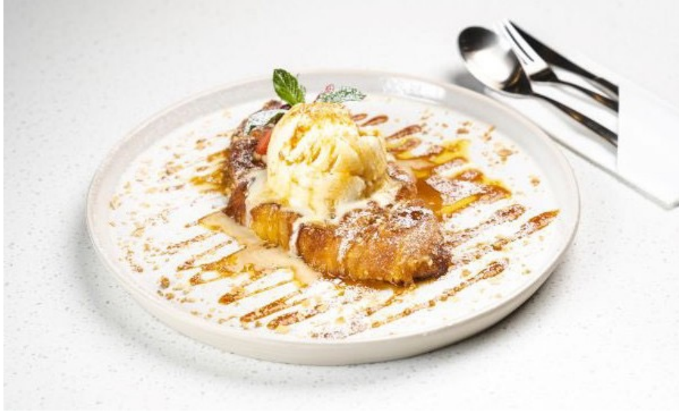
Nook French Toast